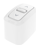
Inis Mounted Box